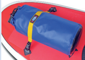
Large Dry Bag