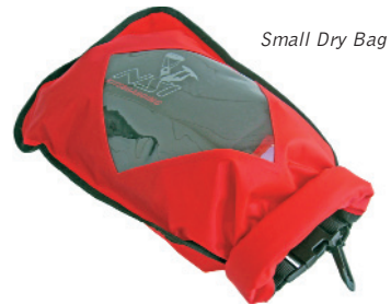
Small Dry Bag